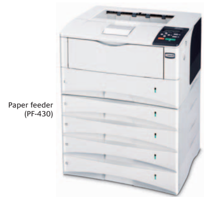
Paper feeder (PF-430)

Product depicted includes optional extras